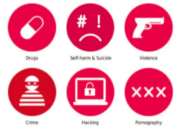
A Parent's Guide to Privacy Settings

Online safety is when young people know who they can tell if they feel upset by something that has happened online.