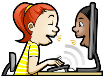
A Parent's Guide to Social Media