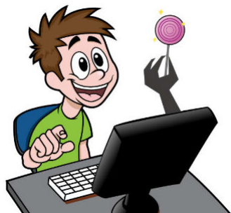
A Parent's Guide to Online Grooming